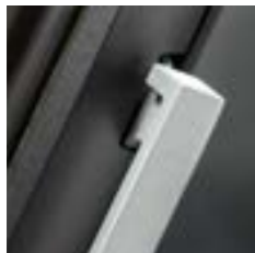
Contrasting handle detail