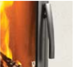
Ergonomically designed handle