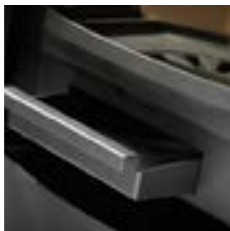
Large capacity ash pan