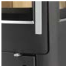
Adjustment of the air supply with one handle