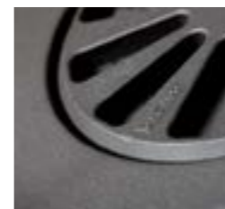
Cast iron disc grate in base for easy ash removal