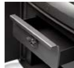
Large capacity ash pan

Aura 1 has a large fire chamber with ample fuel storage space beneath the innovative door which opens when pressed gently.