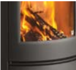
Combustion chamber designed to make it easy to light and clean the stove

The Shape 2 is a slimline stove with tall and slender proportions available in top or rear flue options. Featuring Varde's AirBox system, this advanced stove allows the choice of an external air supply if desired.