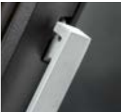
Ergonomically designed, contrasting handle

Designed with both looks and ease-of use in mind, the Samso also features an integral log store and ash draw, with contrasting stainless steel handles to accent the matt black exterior.