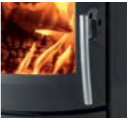
Ergonomically designed handle