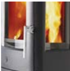
Side windows for an increased flame visual