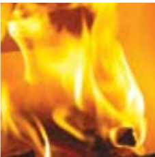
Expansive flame visuals