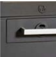
Easy access ash pan