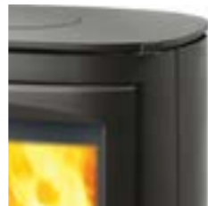
Elegant rounded corners

Combining geometric lines and subtle curves, the distinctive Fuego 1 will make a functional centrepiece in your home.