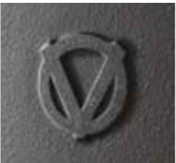
Door, top plate and grate made of high-quality cast iron