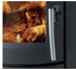
Ergonomically designed handle