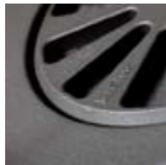
Cast iron disc grate in base for easy ash removal