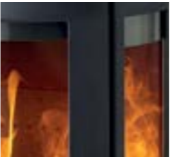
Expansive flame visuals