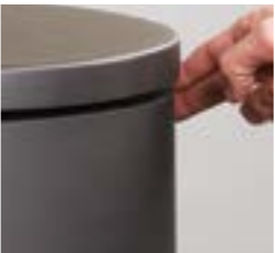
Ergonomically correct adjustment of the air vent