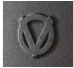
Door, top plate and grate made of high-quality cast iron