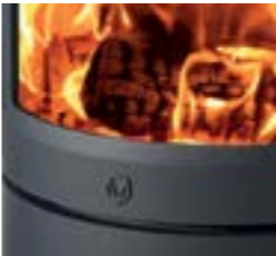
Combustion chamber designed to make it easy to light and clean the stove