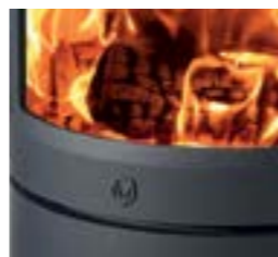
Combustion chamber designed to make it easy to light and clean the stove

Featuring a large curved viewing window and expansive firebox, which can take logs of up to 350mm, the Lincoln woodburning stove offers soaring flame visuals. Producing a generous 7kW high efficiency heat output, this large format stove is suitable for spacious living areas.