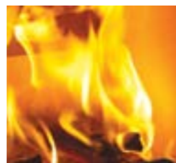
Expansive flame visuals