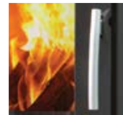
Ergonomically designed handles