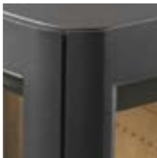
Elegant rounded corners