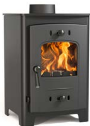
Hardy 4 | 4.2kW A+