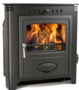
Solution Inset 7 7.1kW A