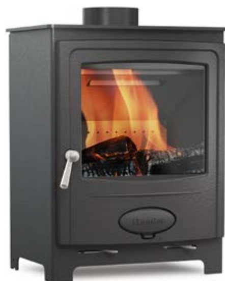
Solution 5 SC S3 | 4.9kW A