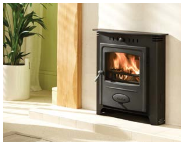
Model shown: Solution Inset 5

Optional extras: Standard flue gather / Long reach flue gather / Safety handle / 5-6' vertical flue adapter