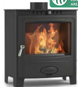
Solution 5 Widescreen 4.9kW A