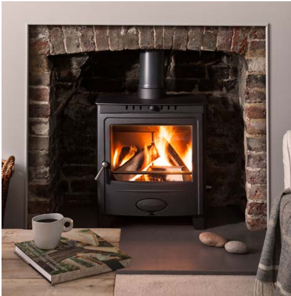
Model shown: Solution 5 Widescreen

Highly efficient, yet simply designed, our Solution range of stoves allow you to generate more heat using less fuel.