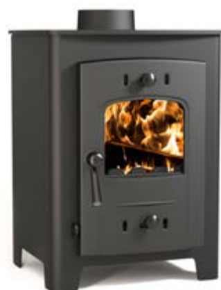
Hardy 5 | 4.9kW A+