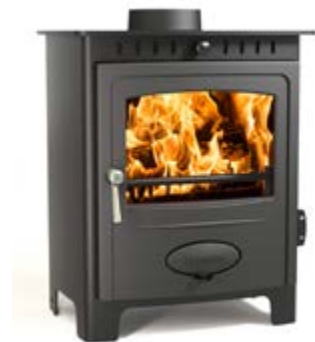
Solution 7 | 6.1kW A