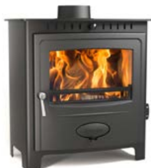
Solution 9 | 8.8kW A