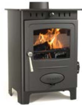
Solution 5 | 4.9kW A

Add-in boiler / Floor fixing kit / Safety handle