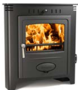
Solution Inset 5 4.8kW A