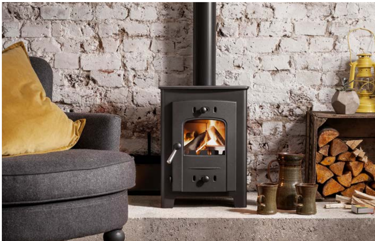
Model shown: Hardy 5

The smallest of the Hamlet range, the Hardy has been designed with small living areas in mind. Whilst compact in size, these stoves still offer all the heat and cosiness needed to stay warm through the winter months. A reliable and controllable heating supply combined with a simple design.