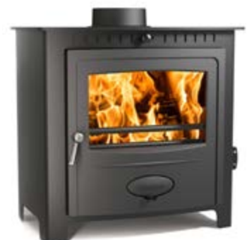
Solution 11 | 11kW A